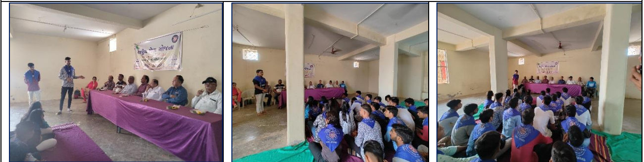
NSS Volunteers' feedback