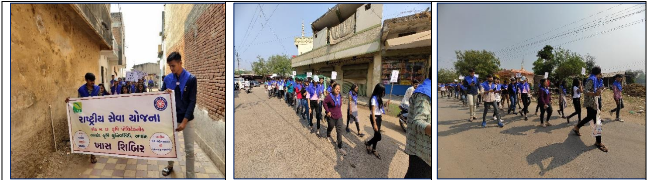
Beti Bachavo, Beti Padhavo Reli