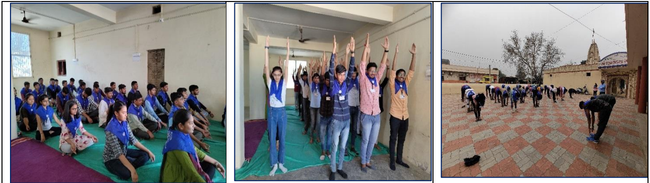
Meditation and Yoga as a Daily routine