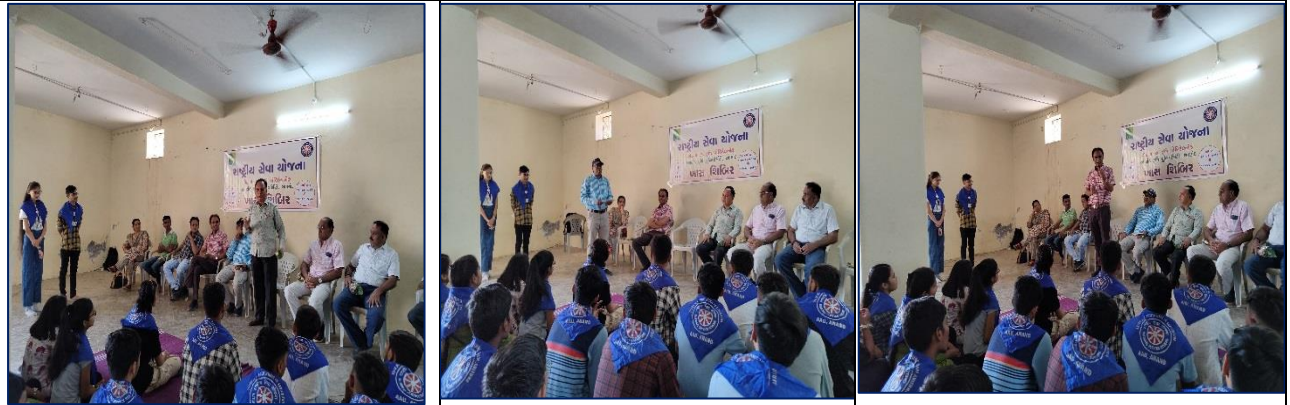
Glimpse of Inaugural Programme of Special Camp

Inaugural Programme of Special Camp and Survey work of Villages and visit of progressive farmer's farm and interaction with farmers