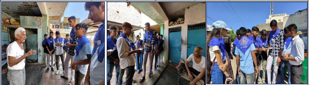
Survey work in Vadod village