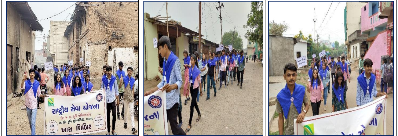
Vyasan Mukti Reli