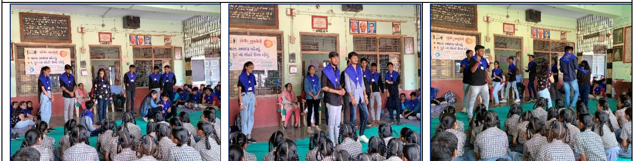
Play on Mobile addiction & Importance of Cleanliness by NSS Volunteers