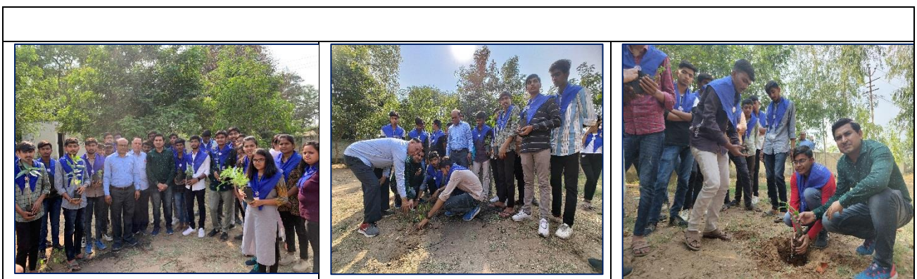
Plantation at Government Girls Primary School, Vadod