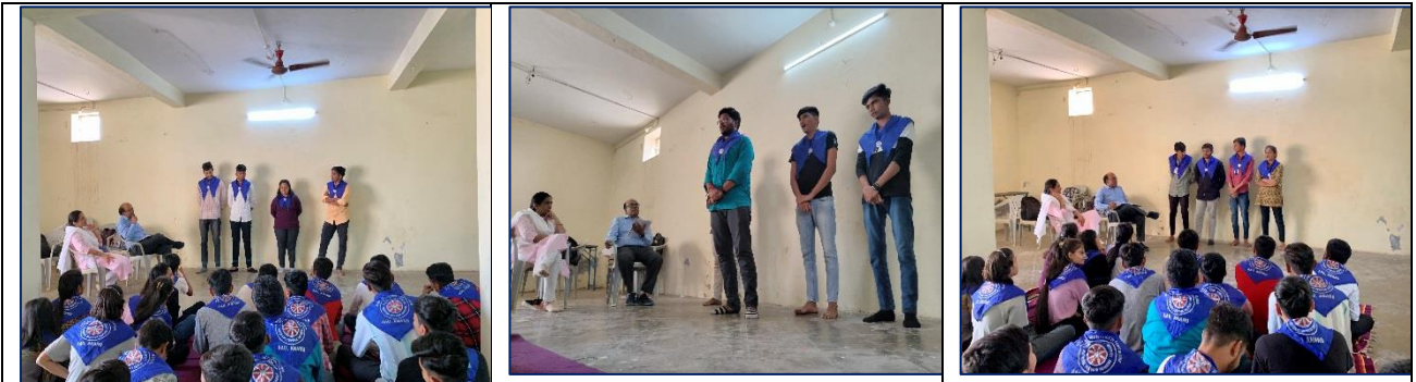
Group Discussion of Various Social Issues