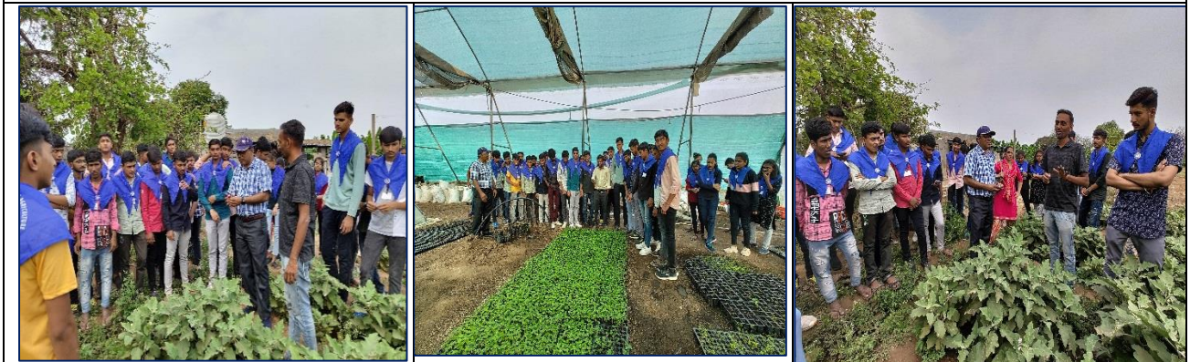
Visit of progressive farmer's farm