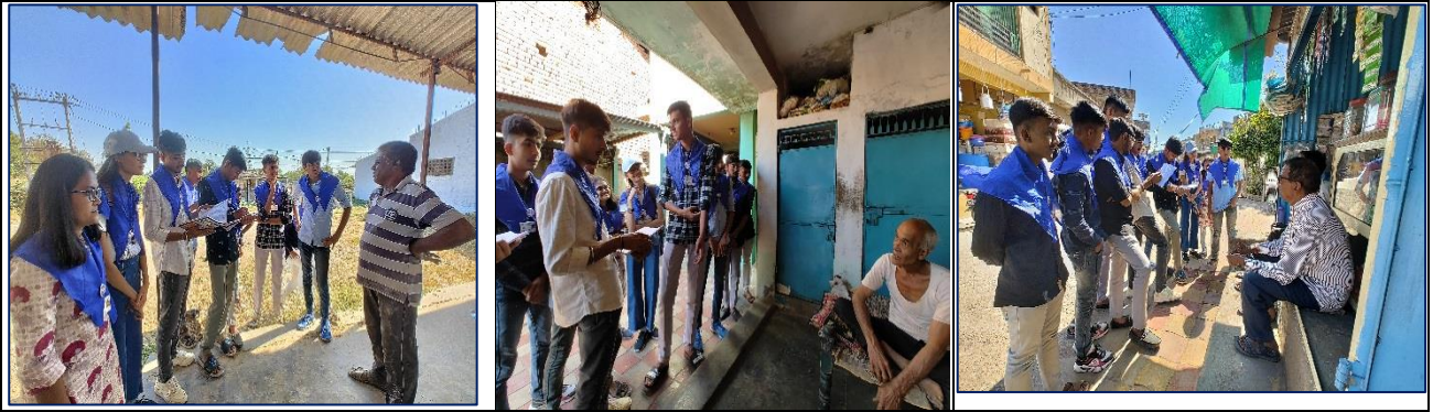
Survey work in Vadod village