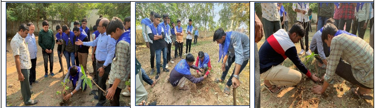
Plantation at Government Girls Primary School, Vadod