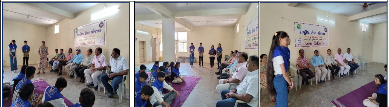
Glimpse of Inaugural Programme of Special Camp