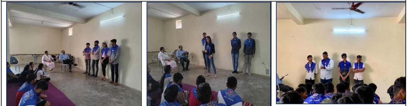
Group Discussion of Various Social Issues