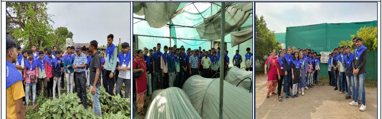
Visit of progressive farmer's farm