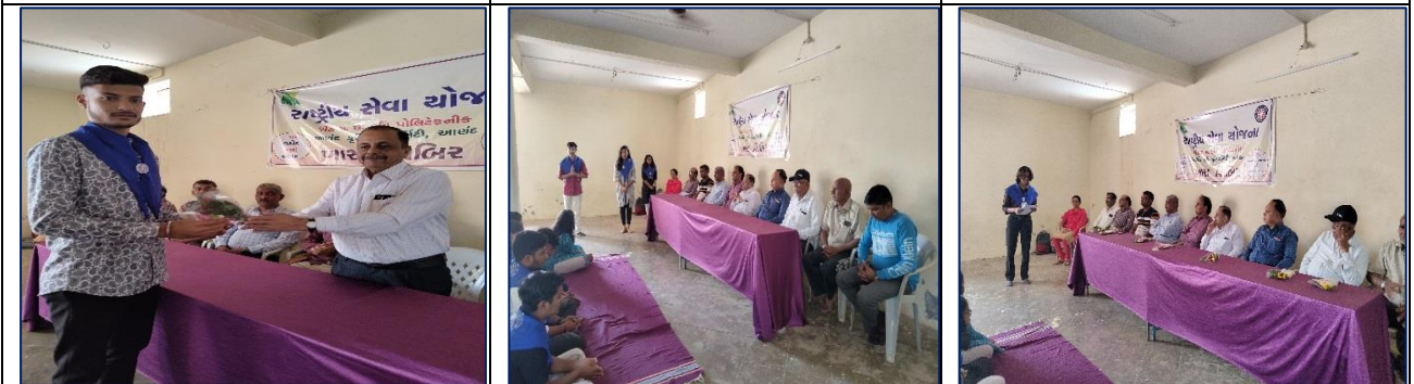
Glimpse of Validatory Function